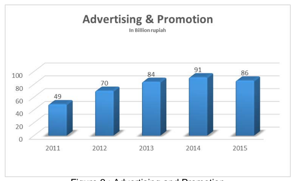
Figure 2 : Advertising and Promotion

On the A&P expenses itself, or the Advertising and Promotion the expenses for Stella has grown significantly in each year. On 2011 stella has spent not lest than 49 billion rupiah and increased for 21 billion in the next fiscal year to 70 billion rupiah in 2012. And kept increasing in 2014 where the advertising and promotion spent for the brand itself is 91 billion Indonesian rupiah, with the increased of 7 billion rupiah from the previous fiscal year in 2013 where the spent of that year is only 84 billion Indonesian rupiah.