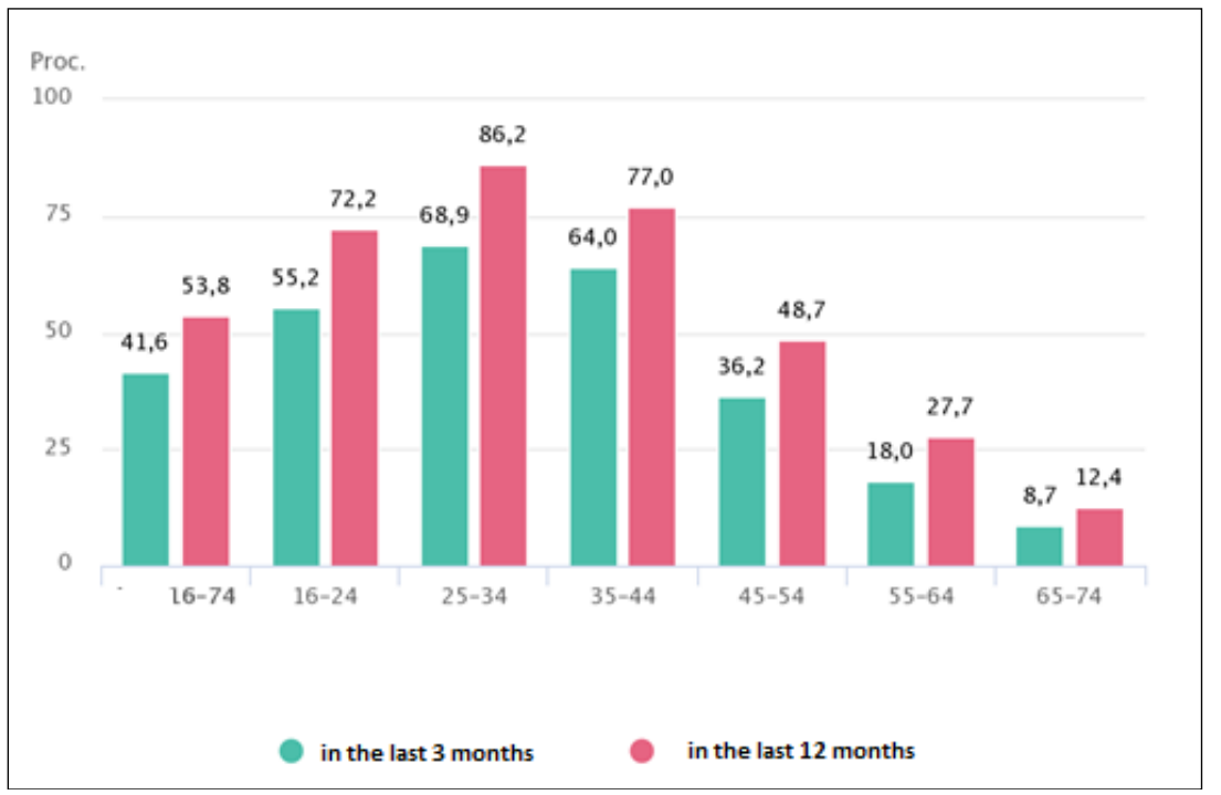
Figure 1: Persons who have bought or ordered goods or services online, by age group in 2020

In a first picture we analyze data from persons who have bought or ordered goods or services online. Persons were divided by age and purchasing time in to different groups.