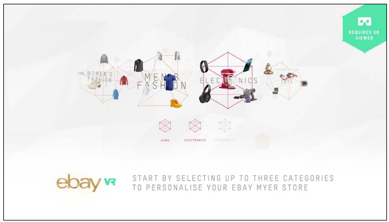
Figure 3: The appearance of the first virtual department store

Yet another example of the use of virtual reality in electronic business doing is the world known website eBay, which made the first department store in virtual reality in cooperation with the Australian firm Myer in 2016. With the help of a mobile device and a VR box, consumers are enabled to browse the products exhibited in that department store. Users had an option to move, rotate, and zoom the products themselves, receive information about the availability of the same in real time, as well as the one considered as the most important of all – the option of buying products (DIECK; JUNG, 2019). Figure 3 illustrates the appearance of the virtual department store.