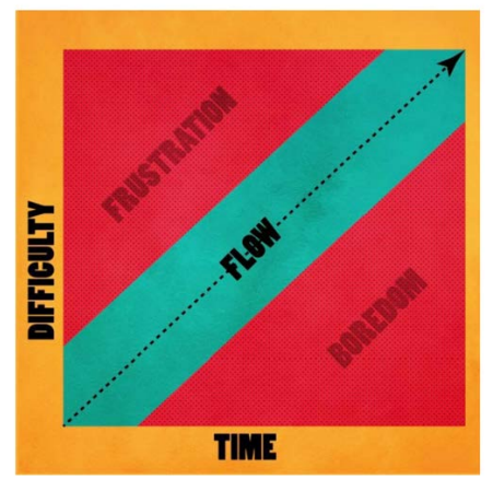
Figure 1: A graphical presentation of the ideal course of the game.

The difficulty of the tasks should slowly be increased in a gradual way in order not to endanger the course of the game. In order to better understand the ideal course of the game, please see Figure 1.